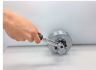
The photo above shows MLM40.

When installing MechaLock, consider the corresponding installation space.