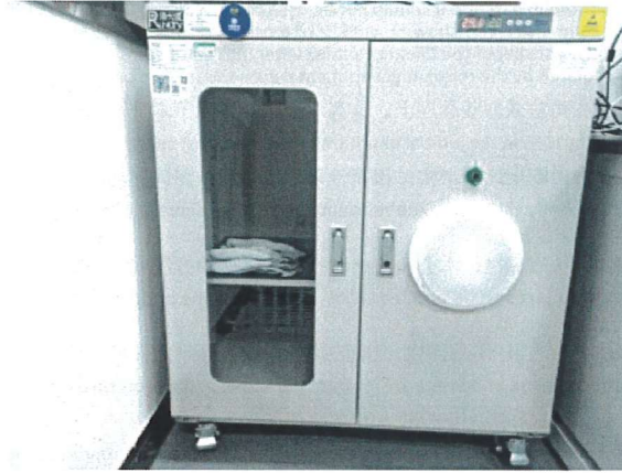
Low humidity drying Cabinets( Humidity:12.0%RH)