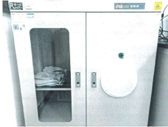
Low humidity drying Cabinets(Humidity:12.0%RH)