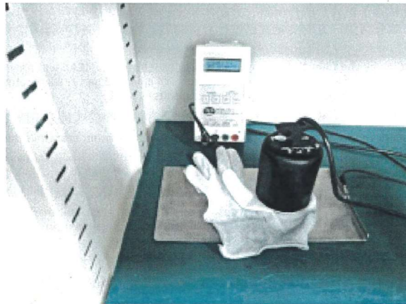
Volume resistance test