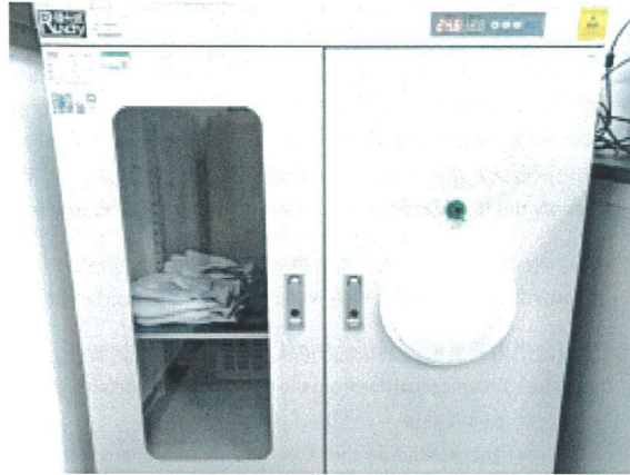
Low humidity drying Cabinets(Humidity:12.0%RH)