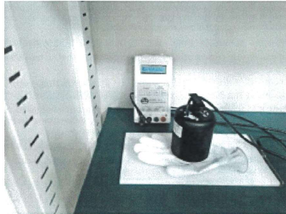
Surface resistance test